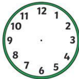
half past 5