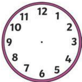
half past 8