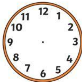
half past 12