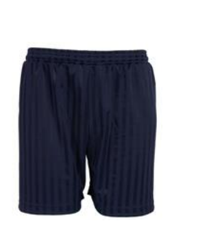
Navy blue or black PE shorts