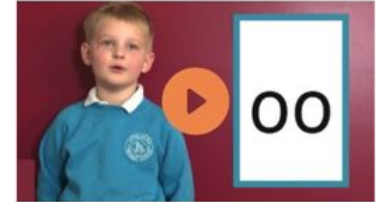
Phase 3 sounds taught in Reception Spring 1