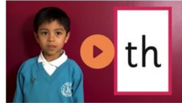
Phase 2 sounds taught in Reception Autumn 2