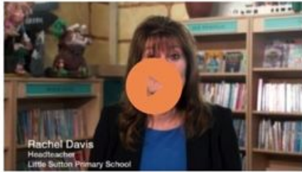
How we teach tricky words