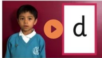
Phase 2 sounds taught in Reception Autumn 1