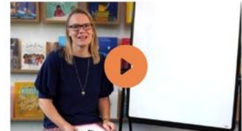
How we teach blending