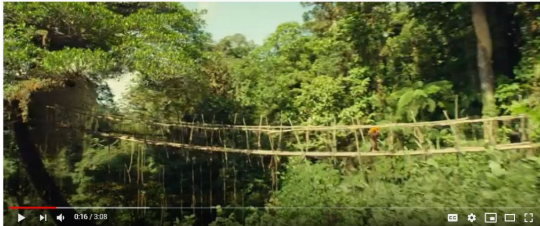
Paddington opening scene_MovieClip

Where does he live? Can you find this country on a map of the World? Which continent is it in?